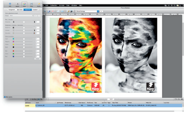
Color manipulations that guarantee the desired result

Do last-minute color adjustments or edit spot colors for the desired final result. The job-based optimization feature allows sub-optimal paper profiles to be easily adjusted to improve output quality.